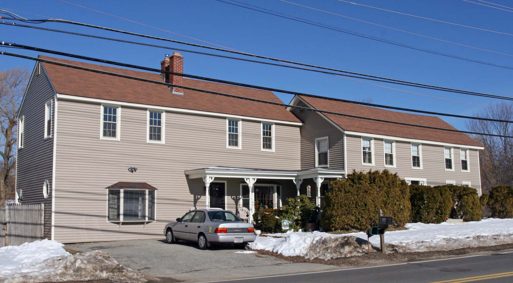
263 Old Westford Road