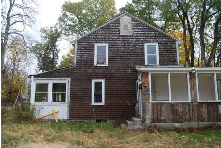
West elevation. View looking east.