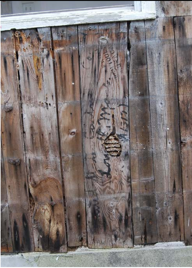
Detail. Packing crate used for west porch siding.