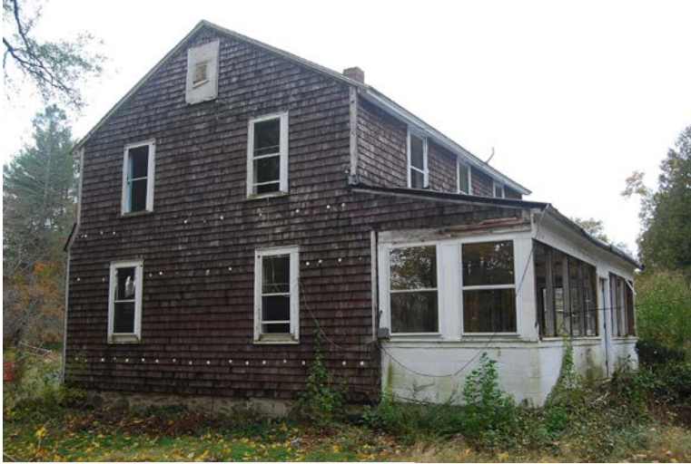
East elevation. View looking west.