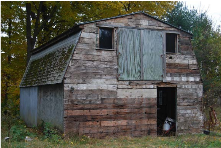
Shed. North (left) and west elevations.