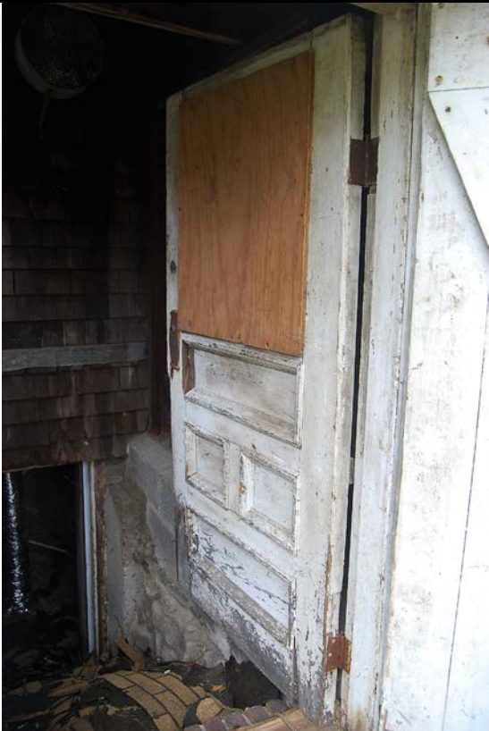
Interior bulkhead door. South elevation.