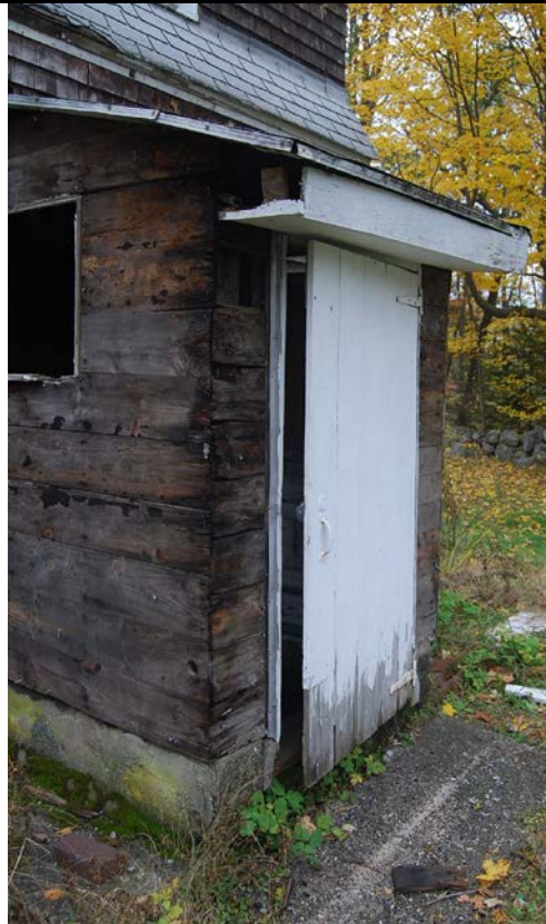
Exterior bulkhead door. South elevation.