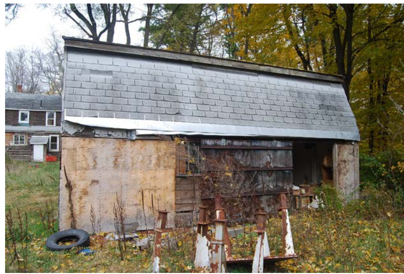
Shed. South elevation.