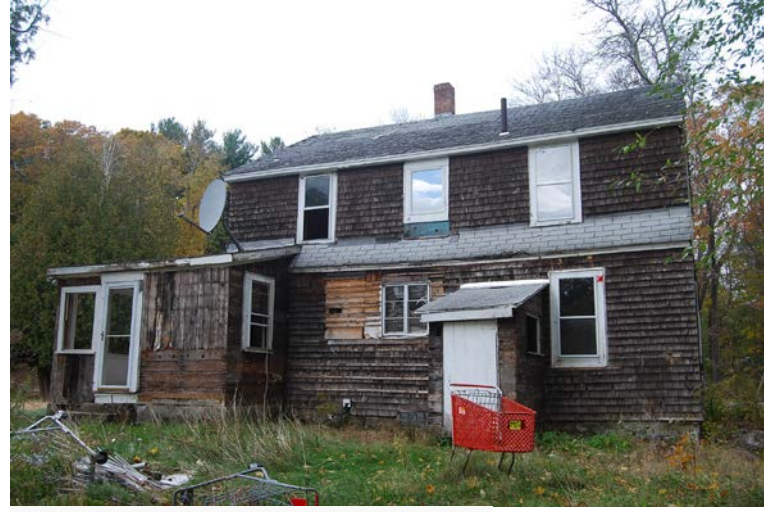
South elevation. View looking north.