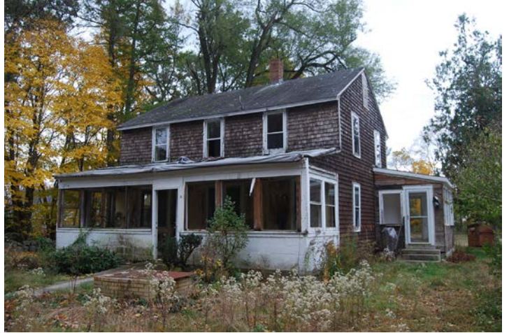
View looking south.