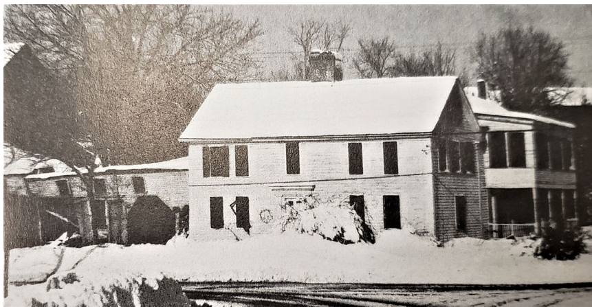
Undated photograph from Images of America: Chelmsford . Note two-story ell at rear of house and deteriorated condition of shed ell.