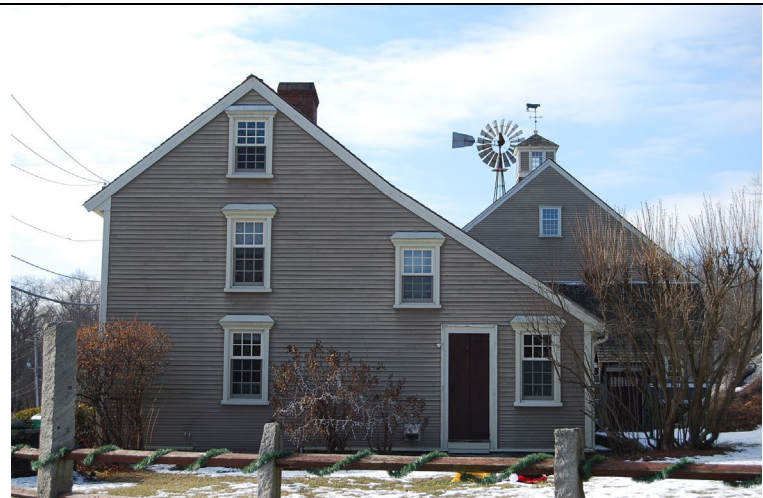
House, east elevation. View looking west. Barn and windmill at right rear.