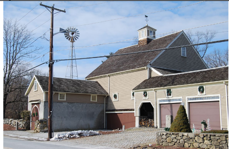
Shed ell, barn, and milk house, view looking northwest.