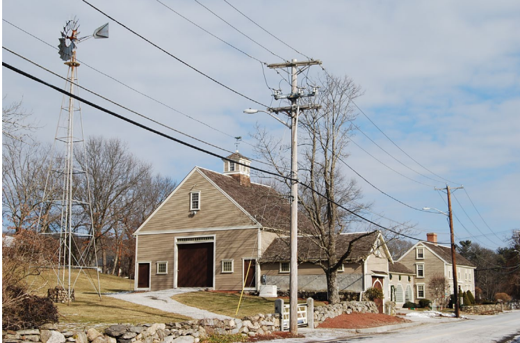
Windmill and well curb, barn, milkhouse, shed ell, and house. View looking east along Pine Hill Road.