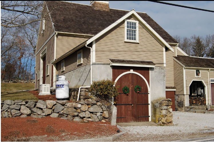
Milk house, view looking north.