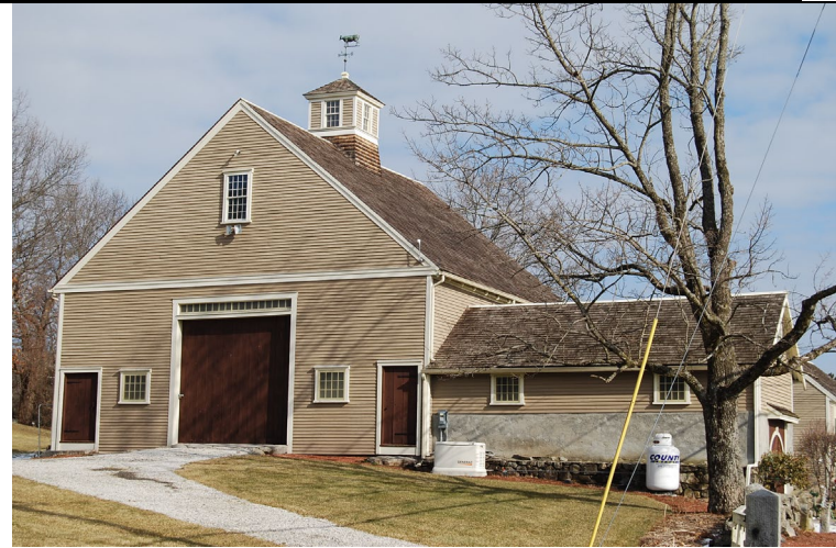
Barn and milk house. View looking northeast.