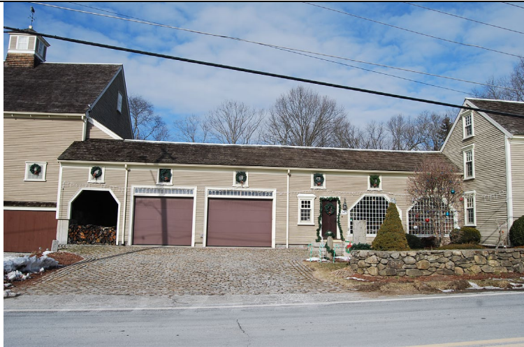
Shed ell, view looking north.