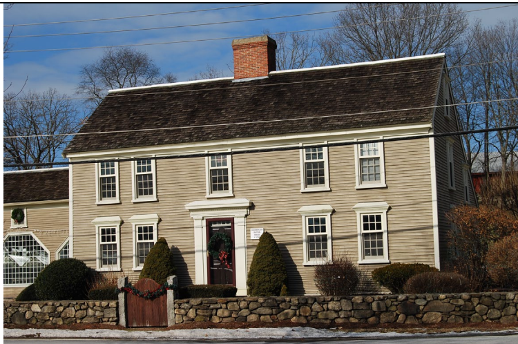
House, façade, view looking north. Shed ell at left.