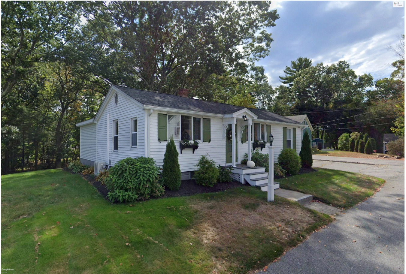
1 Plum Street, 5 March 2021