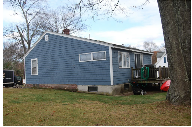
View looking northeast at west and south elevations.