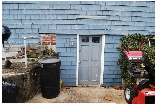
View looking west at basement entrance.