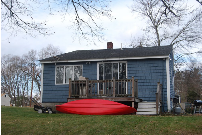
View looking north at rear (south) elevation.