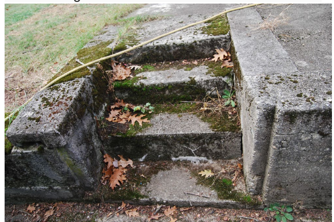
Steps in poured concrete retaining wall. View looking west.