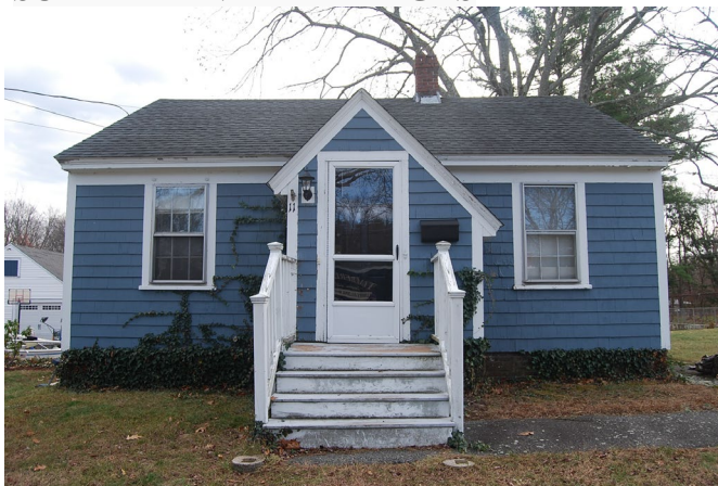
View looking south.