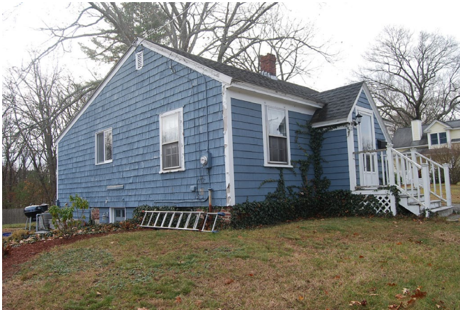
View looking southwest. Basement entrance partially visible below far window.