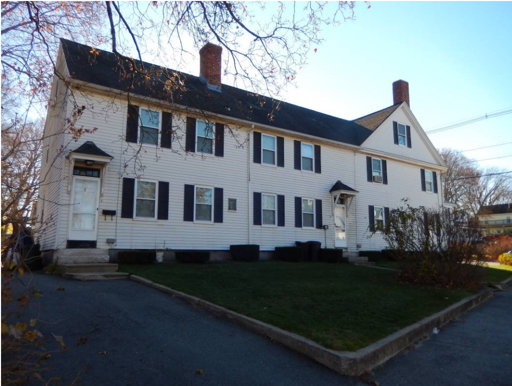
Rear ell of 22-28 Princeton Street, taken from Wright Street, facing south. November 2015.