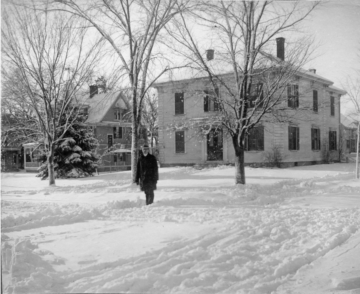
Undated photograph of 45 Princeton Street.