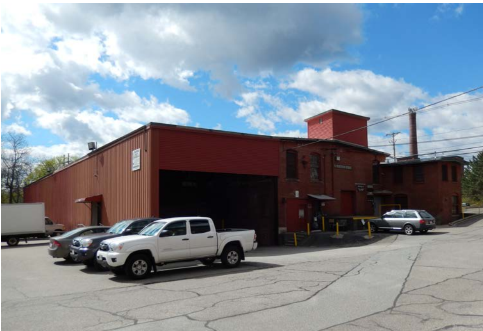
70 Princeton Street, facing south. May 2016.