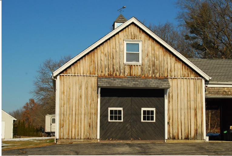
Barn. View looking north from Proctor Road.