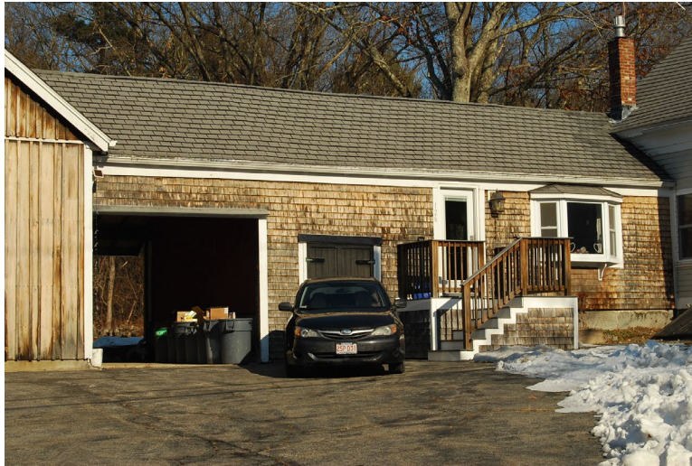
Shed/garage. View looking north from Proctor Road.