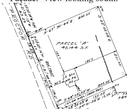
House footprint, as shown on 1983 Plan. Plan Book 141, Plan 144.