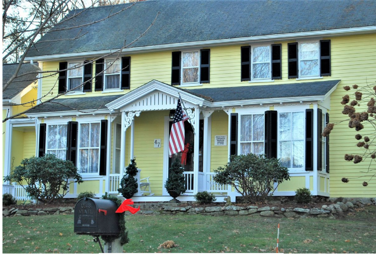
Facade. View looking south.