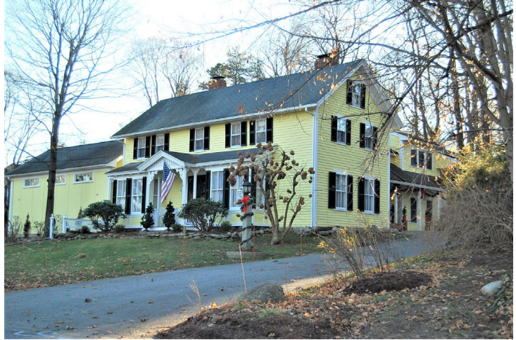
View looking south.