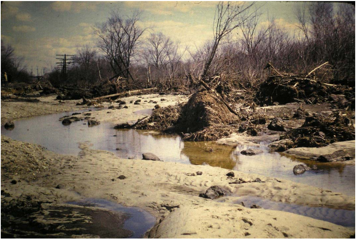
Next to Sony Brook line railbed 4/4/1970 John A Goodwin