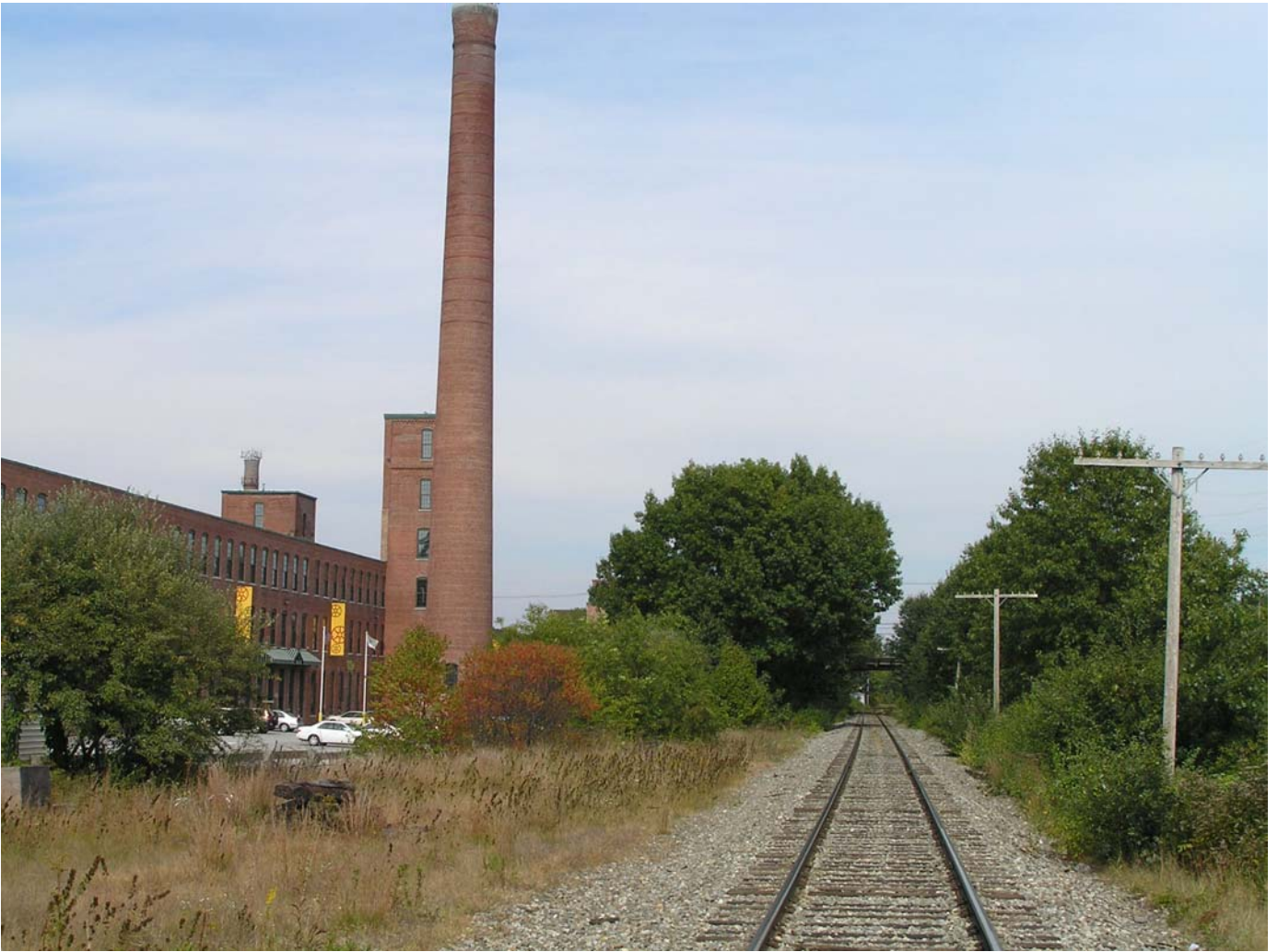
The same view today 9/25/2004 F Merriam