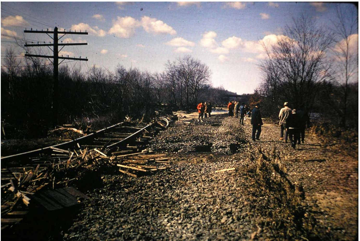
Stony Brook railbed looking toward Route 3 overpass 4/4/1970 John A Goodwin