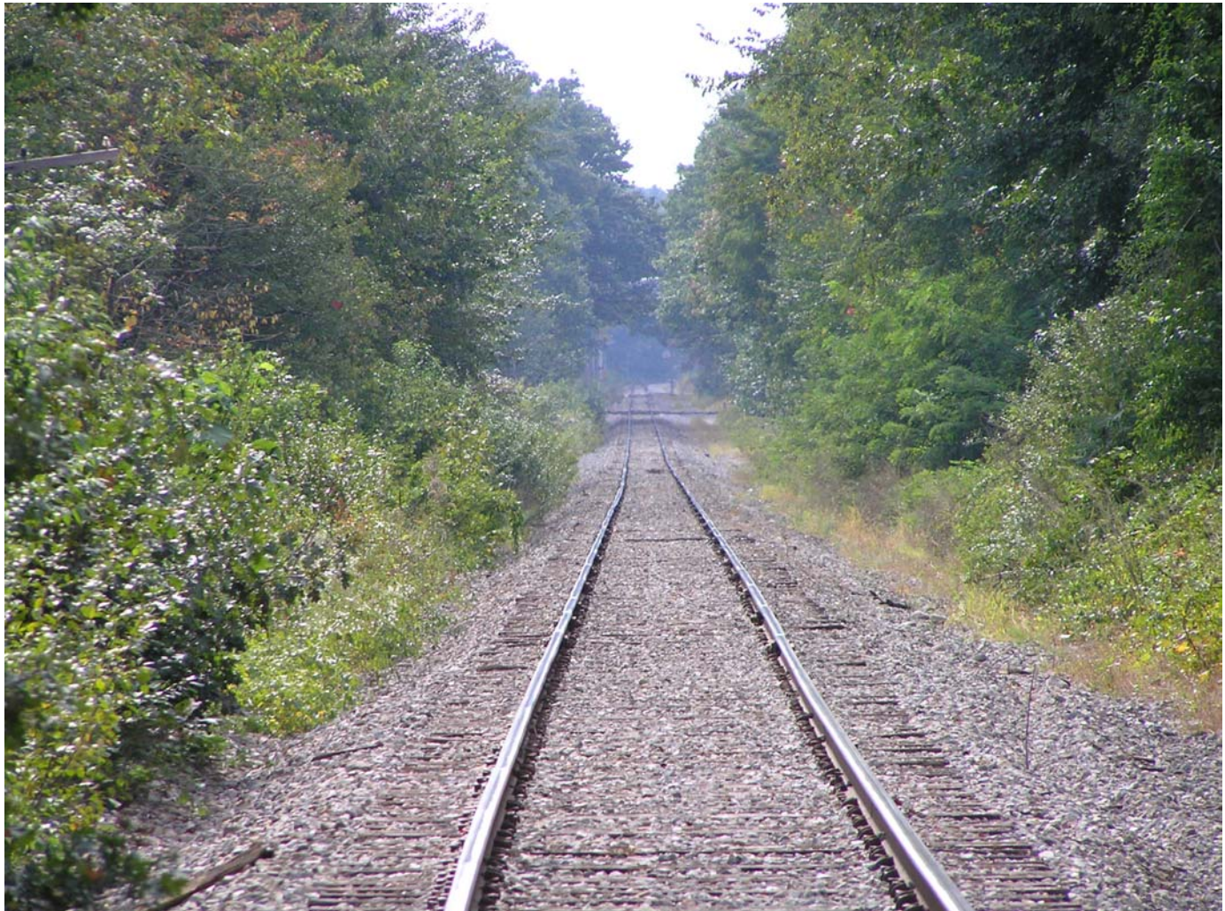
The railbed today, looking toward the Route 3 overpass 9/25/2004 F Merriam