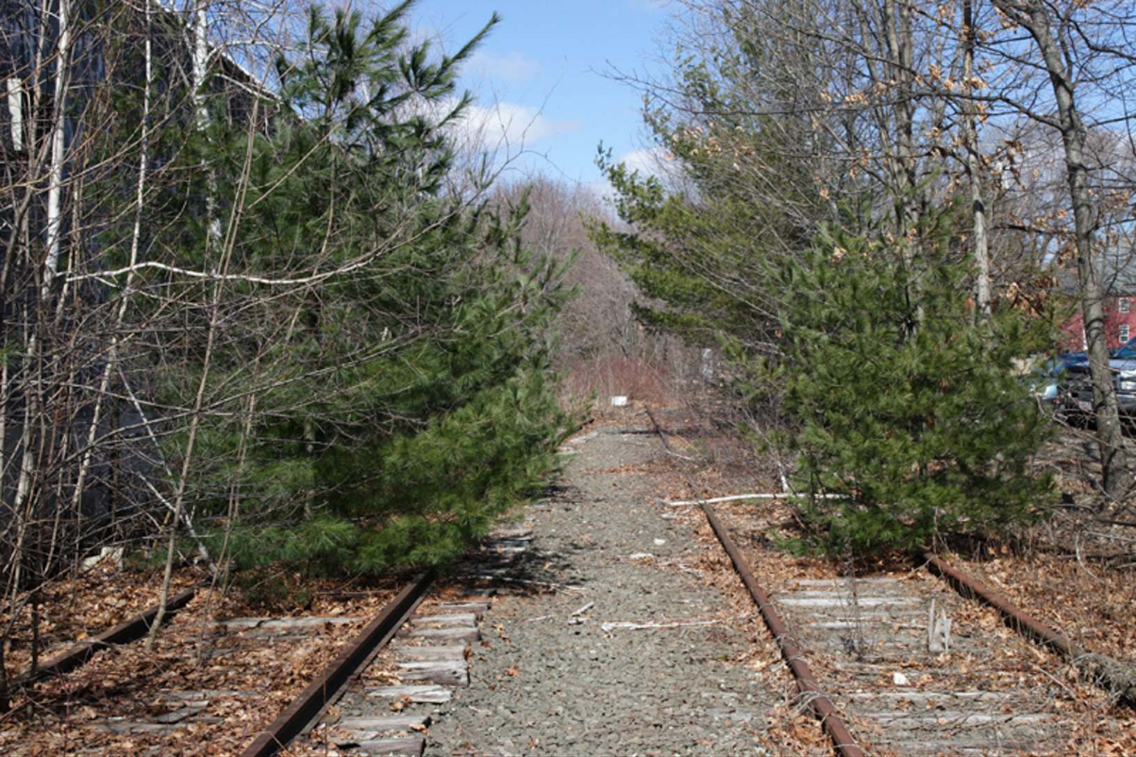
This is the Depot site today, looking east, with Agway at left and the Lockheed Martin parking lot on the right