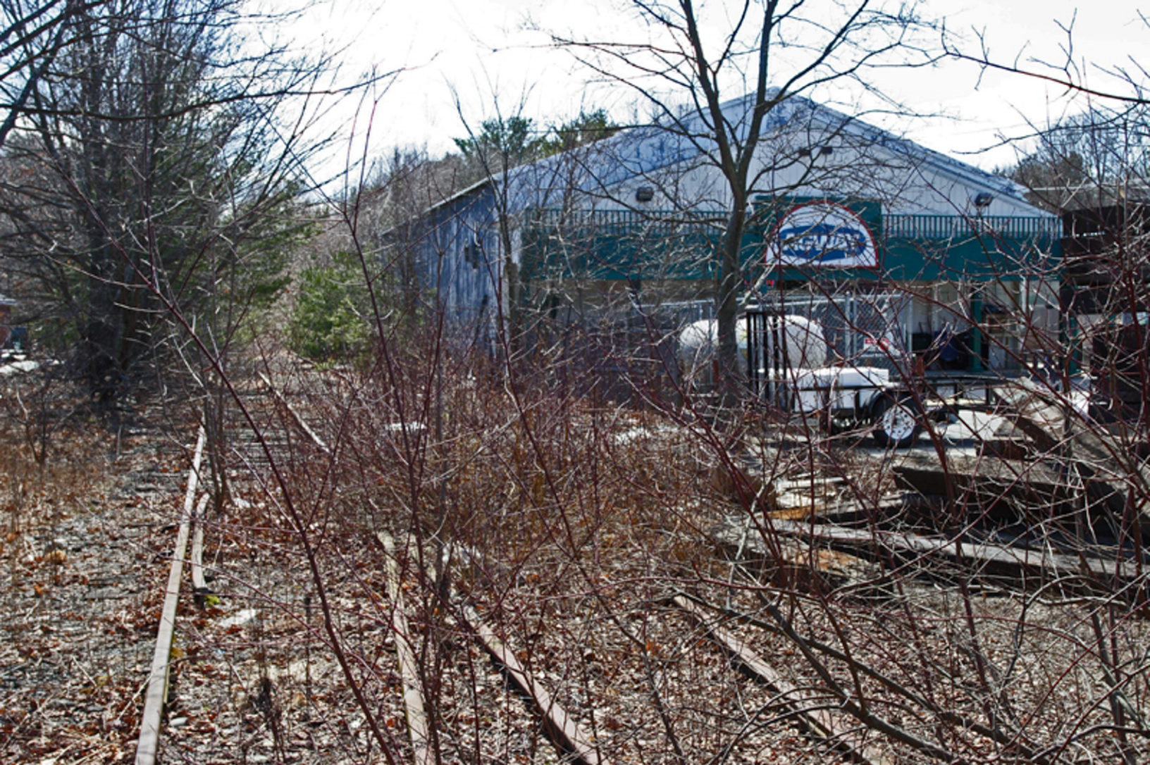
Looking West, with Agway in the freight depot location