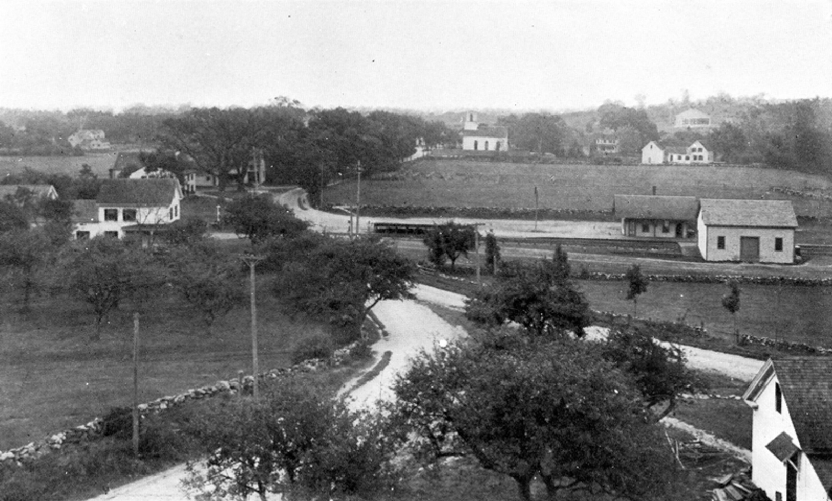
South Chelmsford Railroad Depot looking down at the junction of Maple and Parkerville Roads