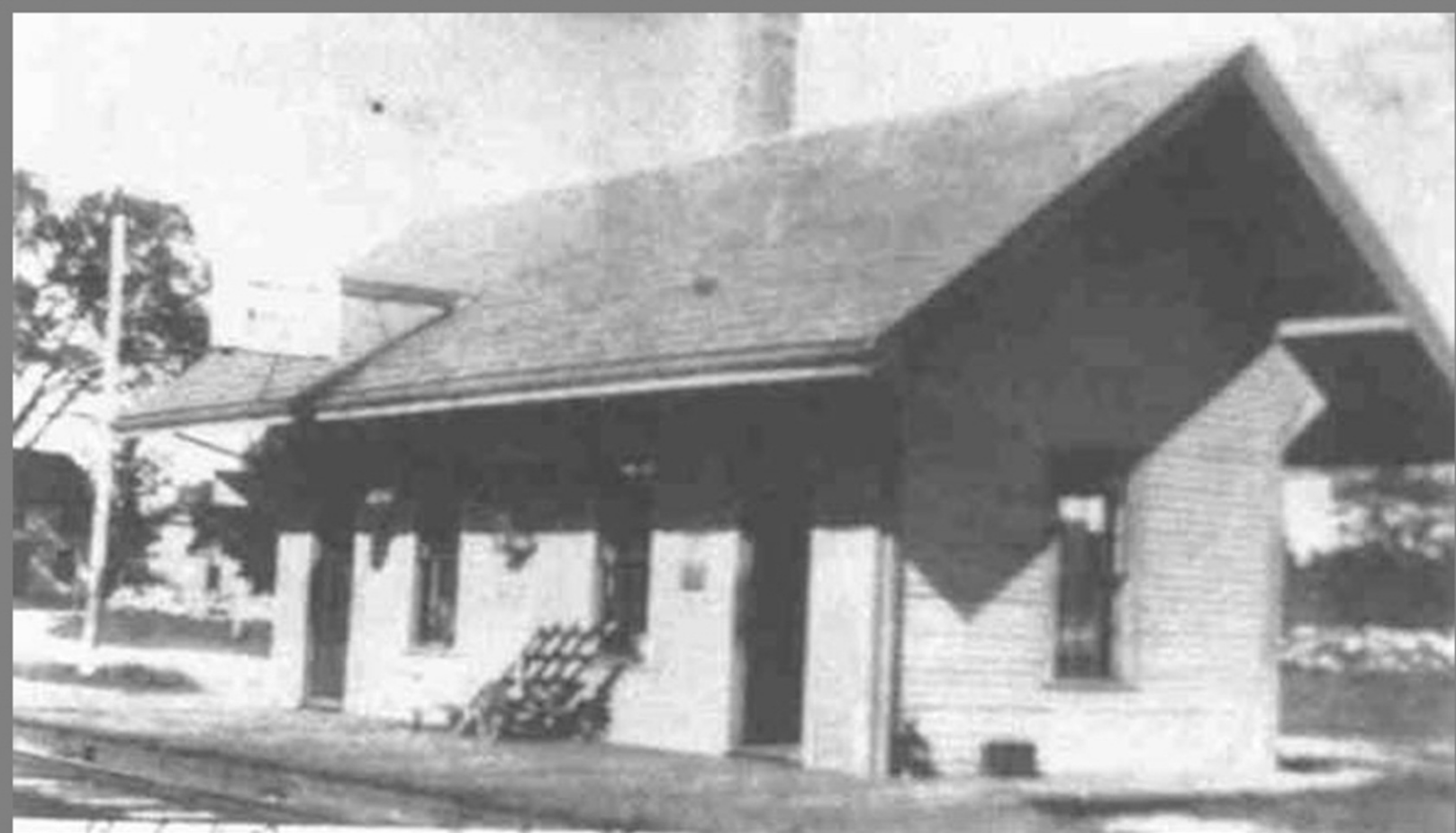
South Chelmsford Railroad Depot, 19 Maple Road (Red Wing Farm) on left