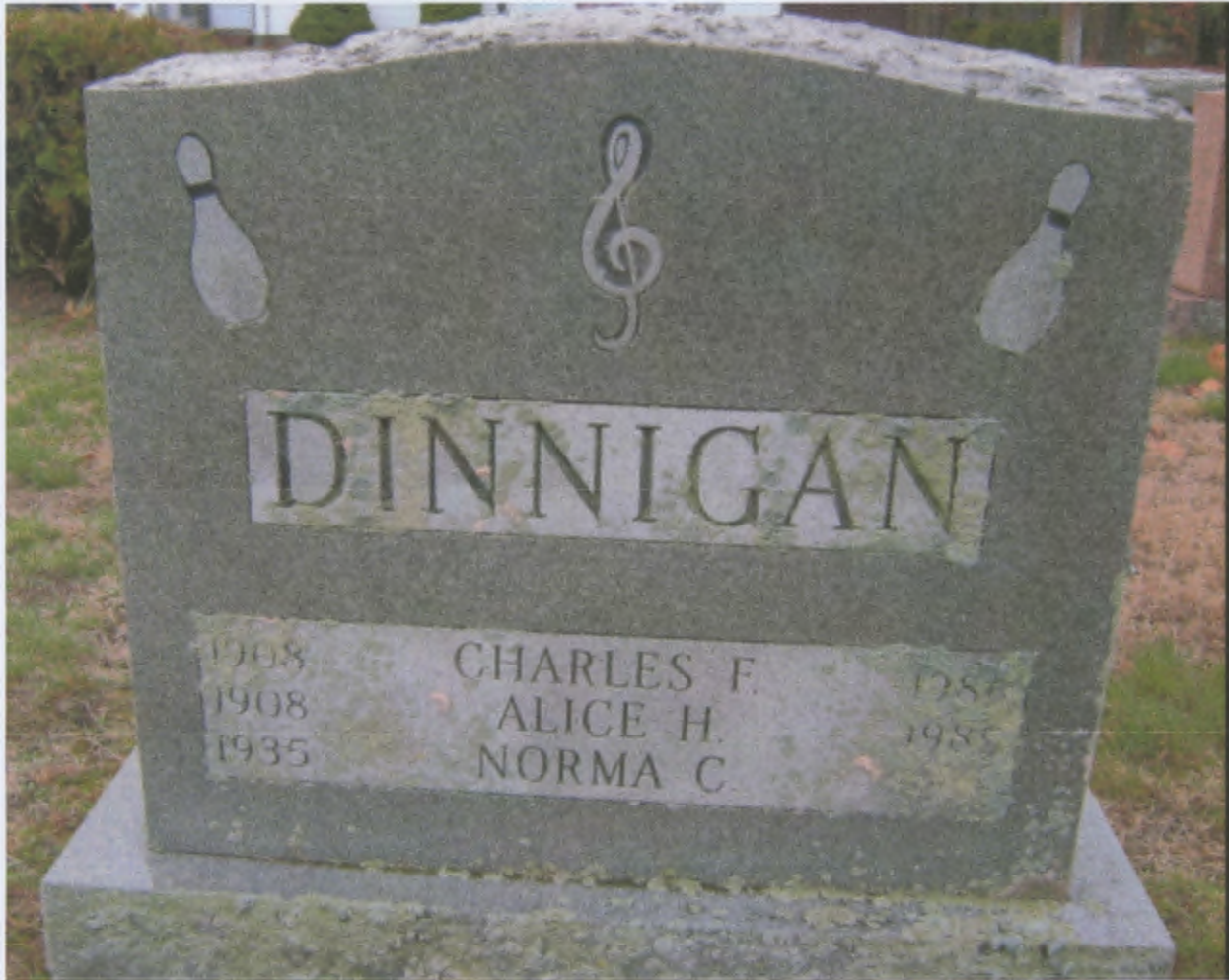
Riverside Cemetery, Gorham Street, Chelmsford