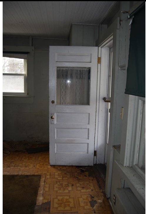
Detail. Main entrance. View looking west.