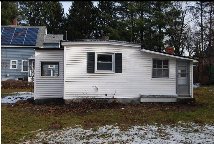
View looking east.