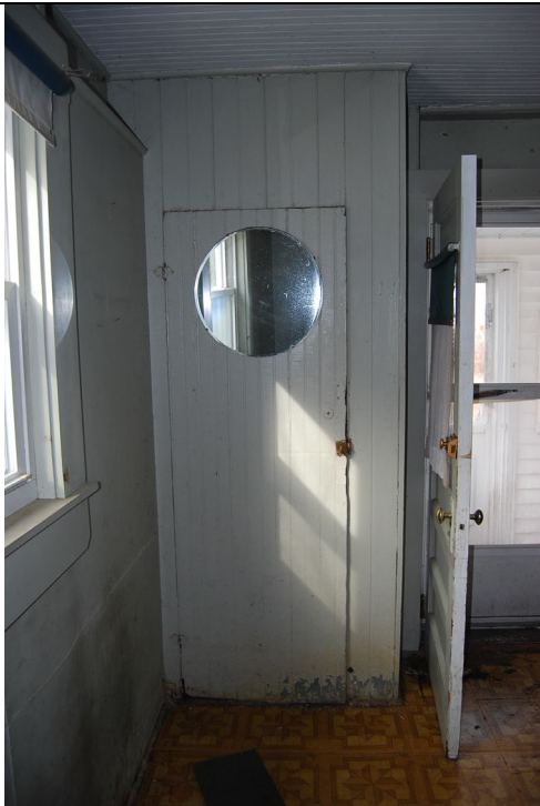
View looking north toward closet on north wall. Entrance visible at right.