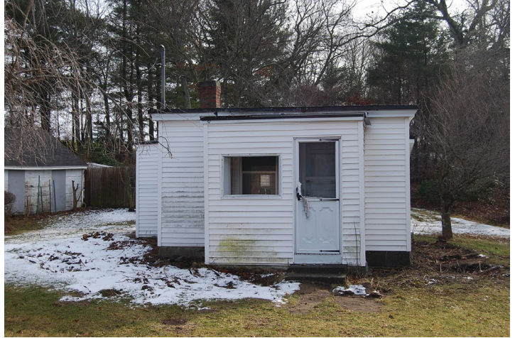
View looking south from front yard.