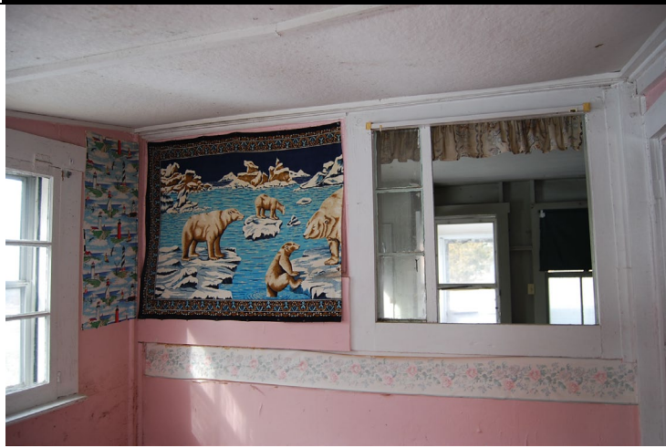
View looking north from southwest room toward main room. Note sliding window between the rooms.