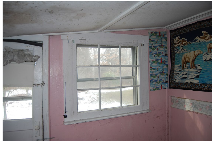
View looking northwest from southwest room toward west elevation. Note 6-light hopper window.