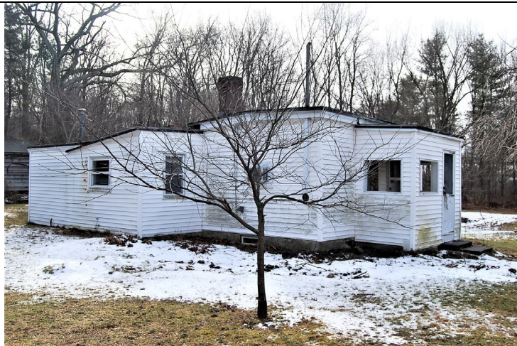
View looking southwest. From right to left: porch, main room, kitchen (with shed roof), and bathroom ell.