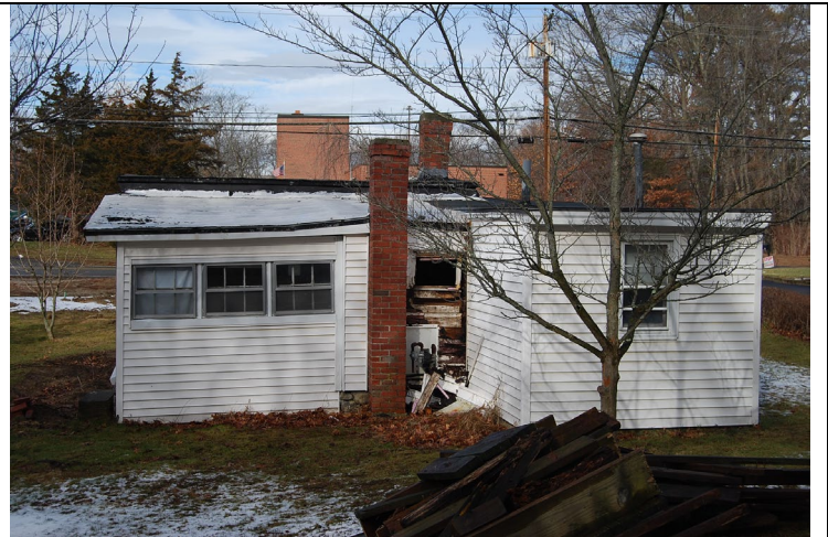
View looking north. Bedroom at left, bathroom at right.