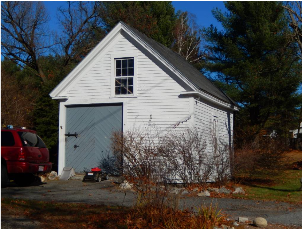
Garage at 44 School Street, facing northeast. November 2015.