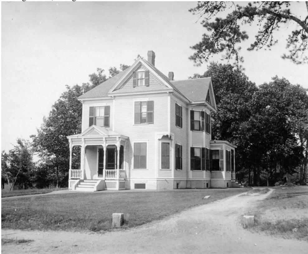
Undated photograph of 48 School Street showing fishscale shingle detail in the pediment and history two-over-one windows.