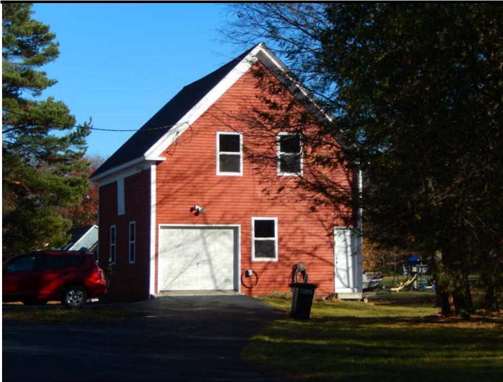
Carriage house, facing northeast. November 2015.