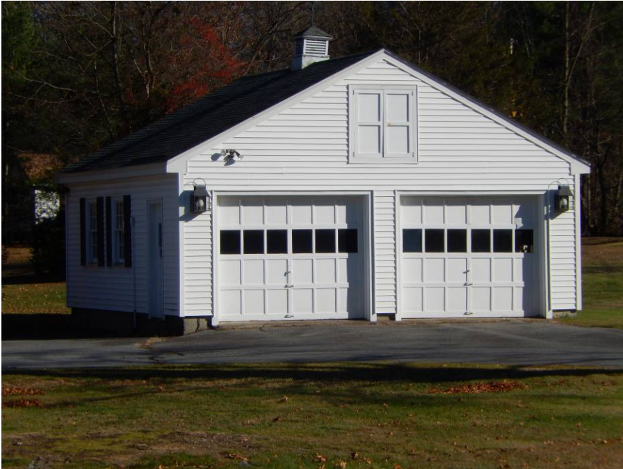
Garage, facing northeast. November 2015.