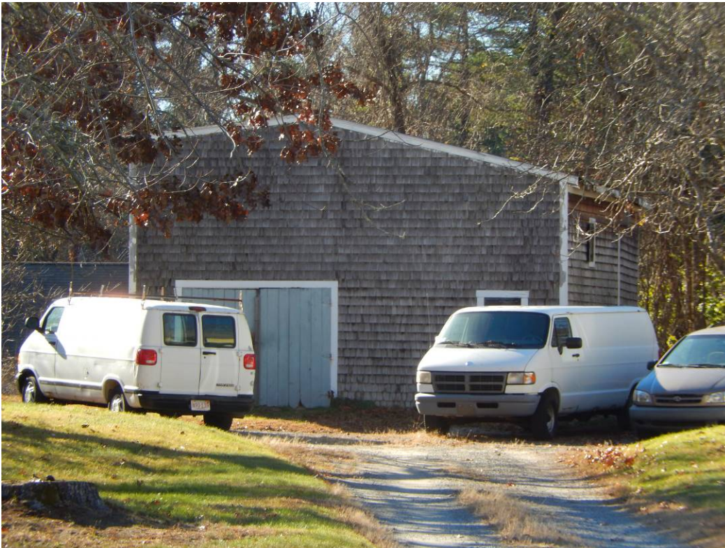
Garage, facing west. November 2015.