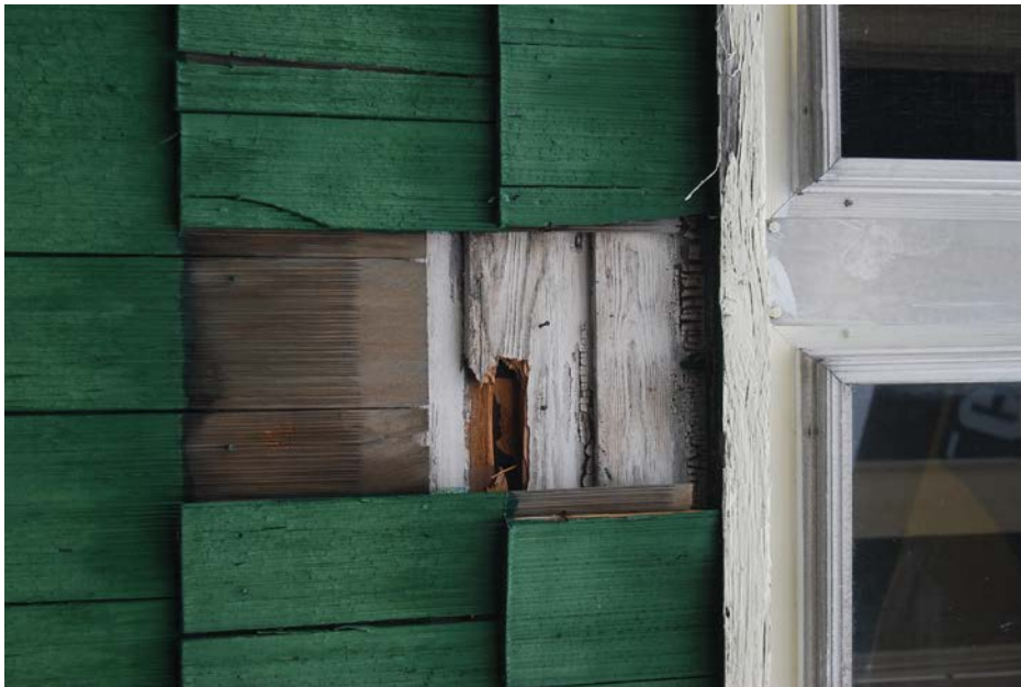
Detail, clapboard under grooved wood shingles.