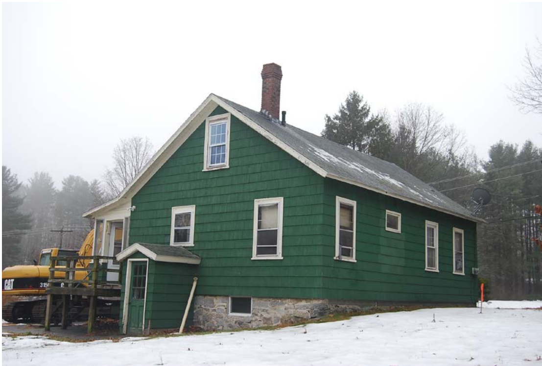
West and north elevations. Note single row of rusticated concrete block at foundation at north elevation.