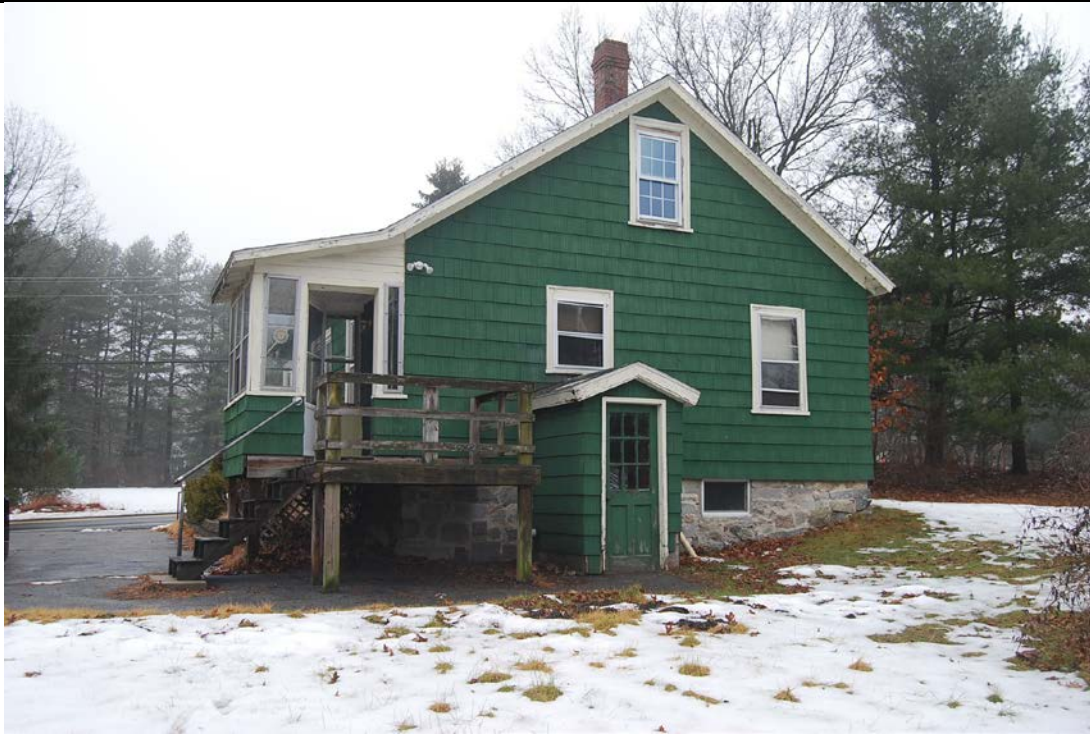
East elevation. Note: foundation is entirely rubble stone at this elevation.