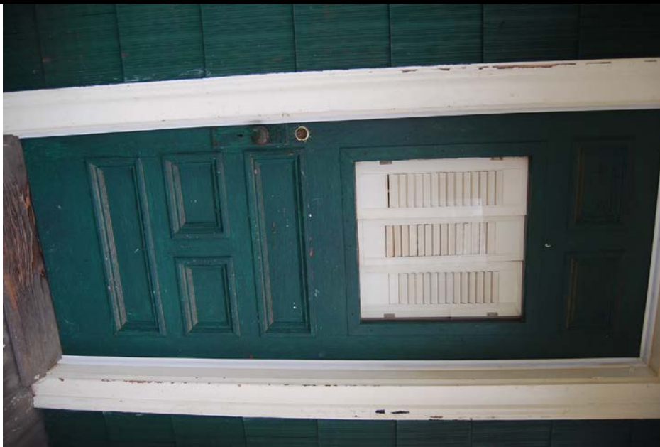
Door (typical west and south elevations.)