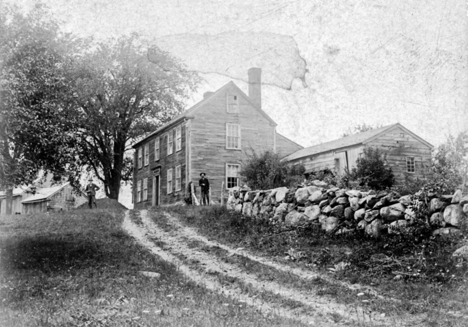
55 Spaulding Road