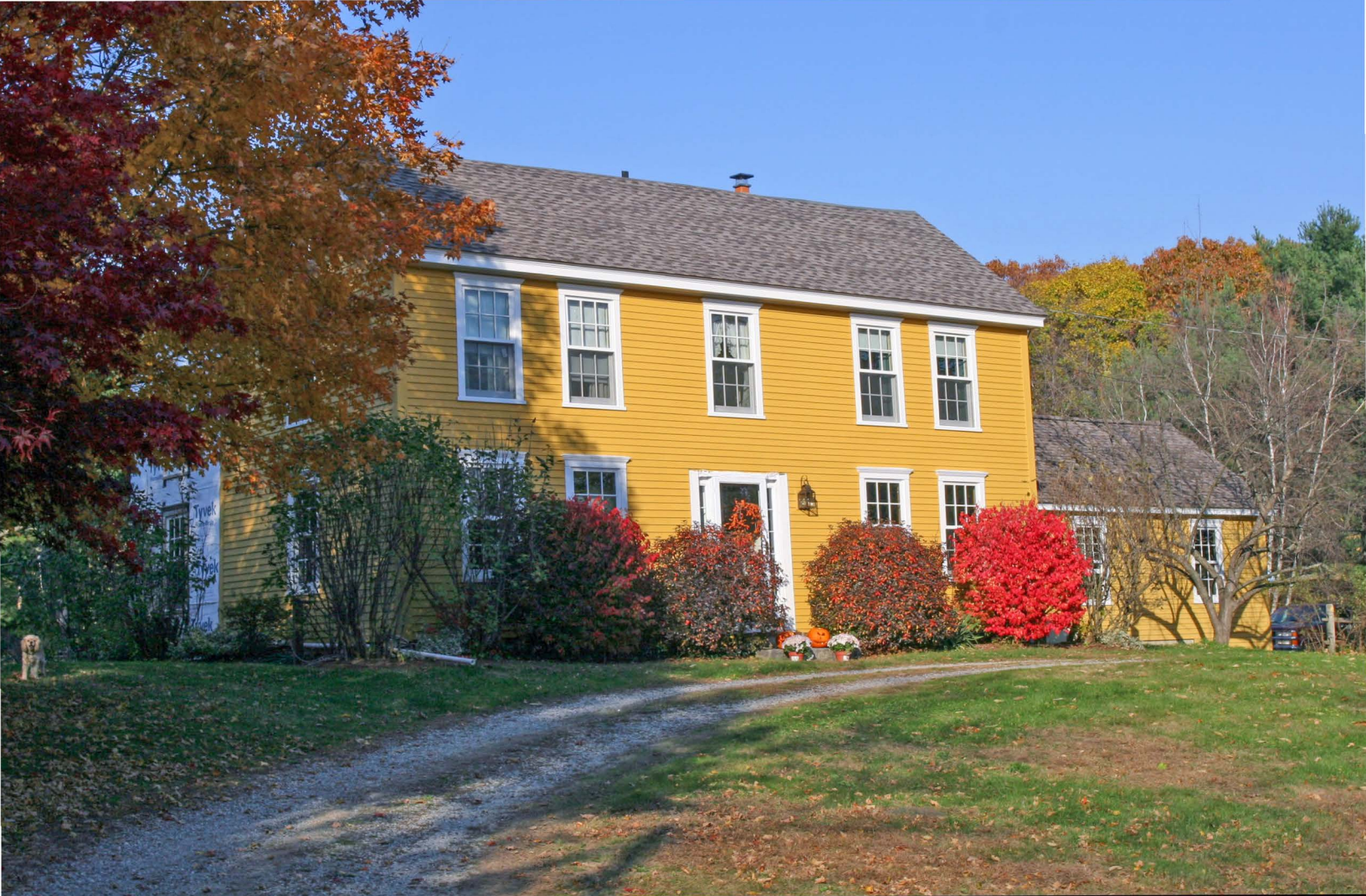
Spaulding Road #55