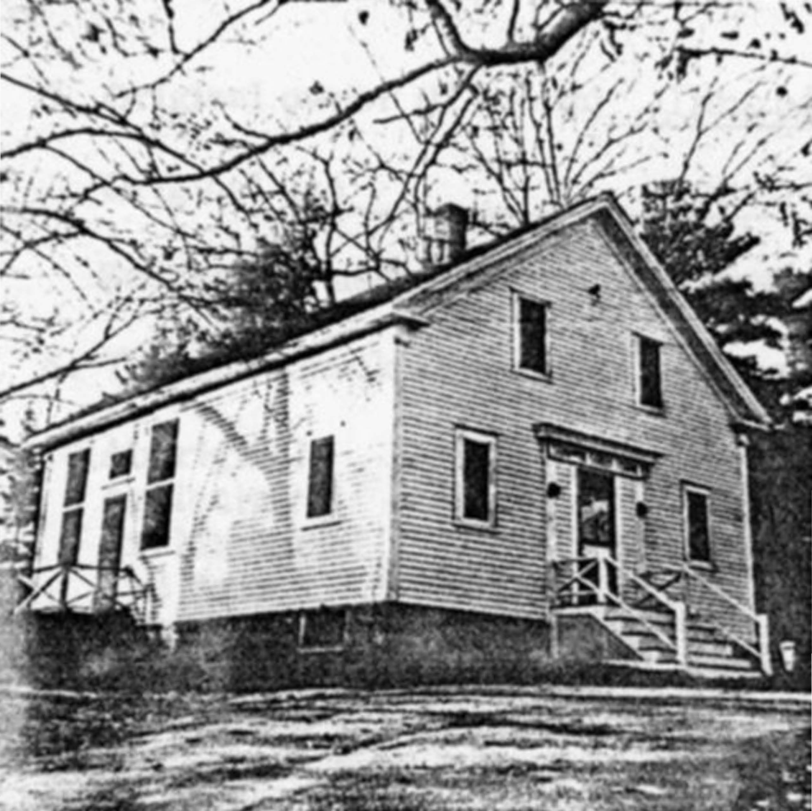
12 Stedman Street - Golden Cove School