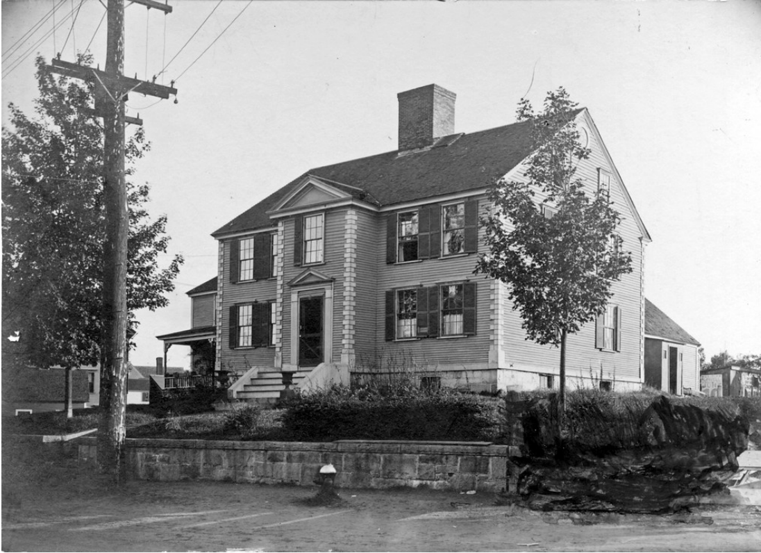
Pre-1910 photograph of the former Adams Tavern building, showing site preparation at the lower right for the 11 Vinal Square building.

Sanborn Fire Insurance Maps of Lowell, MA. 1907 and 1950.