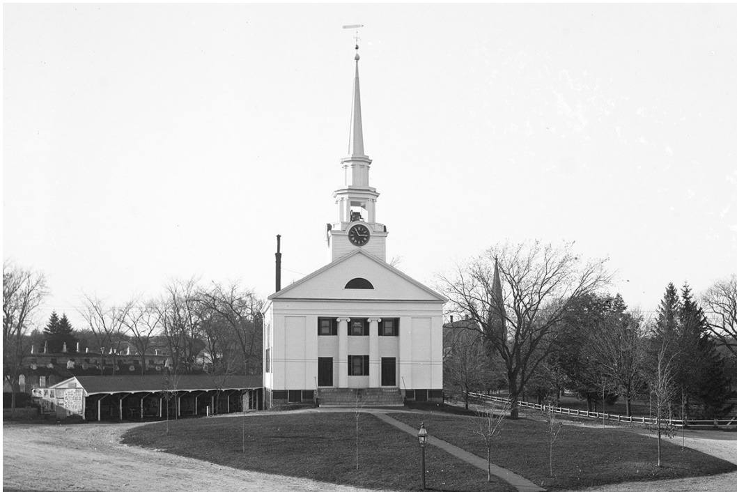
Ca. 1900 photograph after landscaping improvements were implemented.