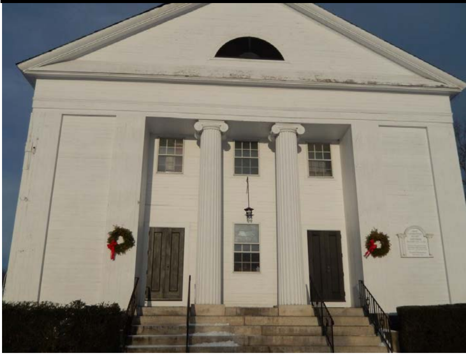
Detail of primary façade of First Parish Church, facing northwest. January 2016.