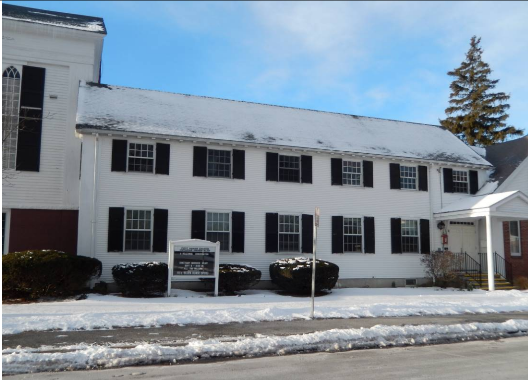
Sunday School, facing south. January 2016.