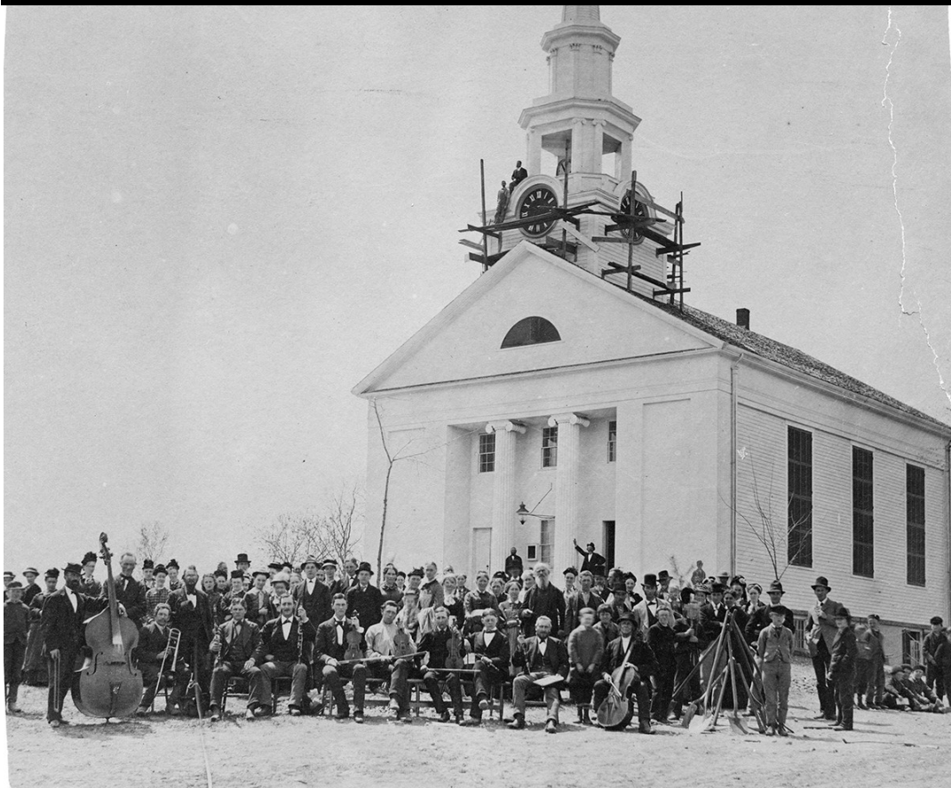
Dedication Ceremony for the new clock and restored steeple, May 17, 1876.