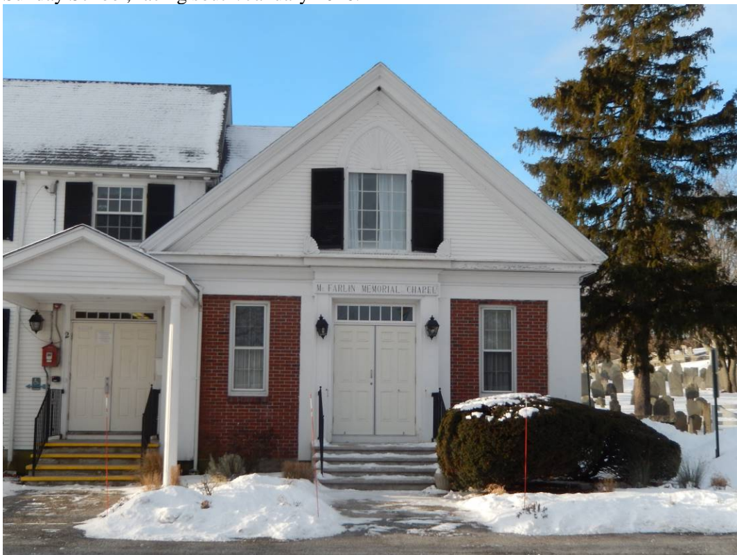
McFarlin Chapel, facing south. January 2016.