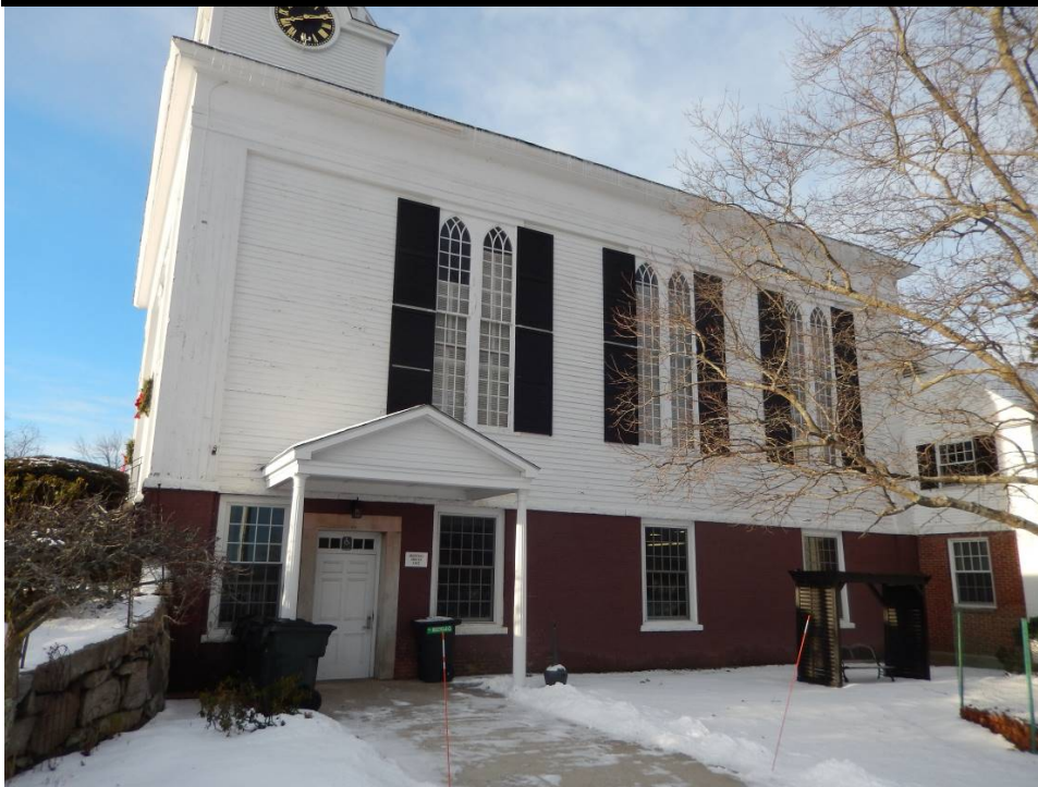
Detail of north of church, facing south. January 2016.