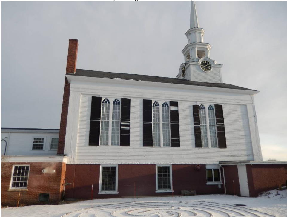
Detail of south wall of church, facing north. January 2016.