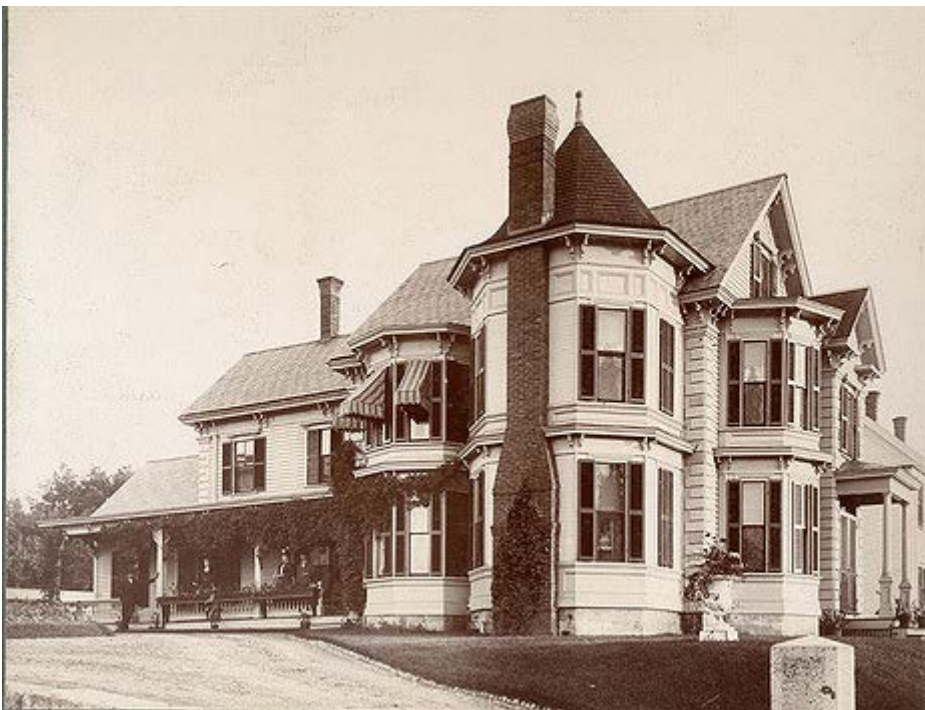
Ca. 1900 photograph of 16 Wright Street.